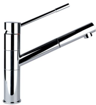
Mixer Tap Lorenzo 8466 000