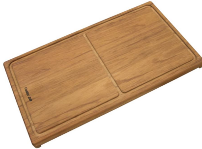
Iroko-wood sliding chopping board 8643 000