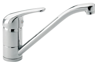
Mixer Tap S1000 - RO 8443 002